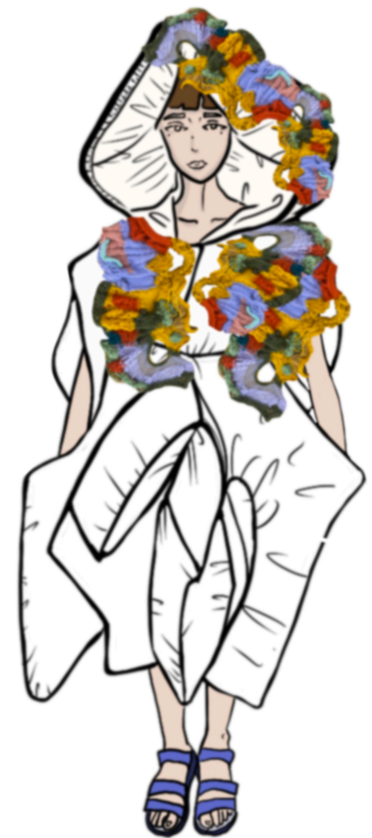
Process of doing drapping from bed blanket to a toile. Idea was winter fairy finding their way to live from recycling human blanket into heavy winter coat