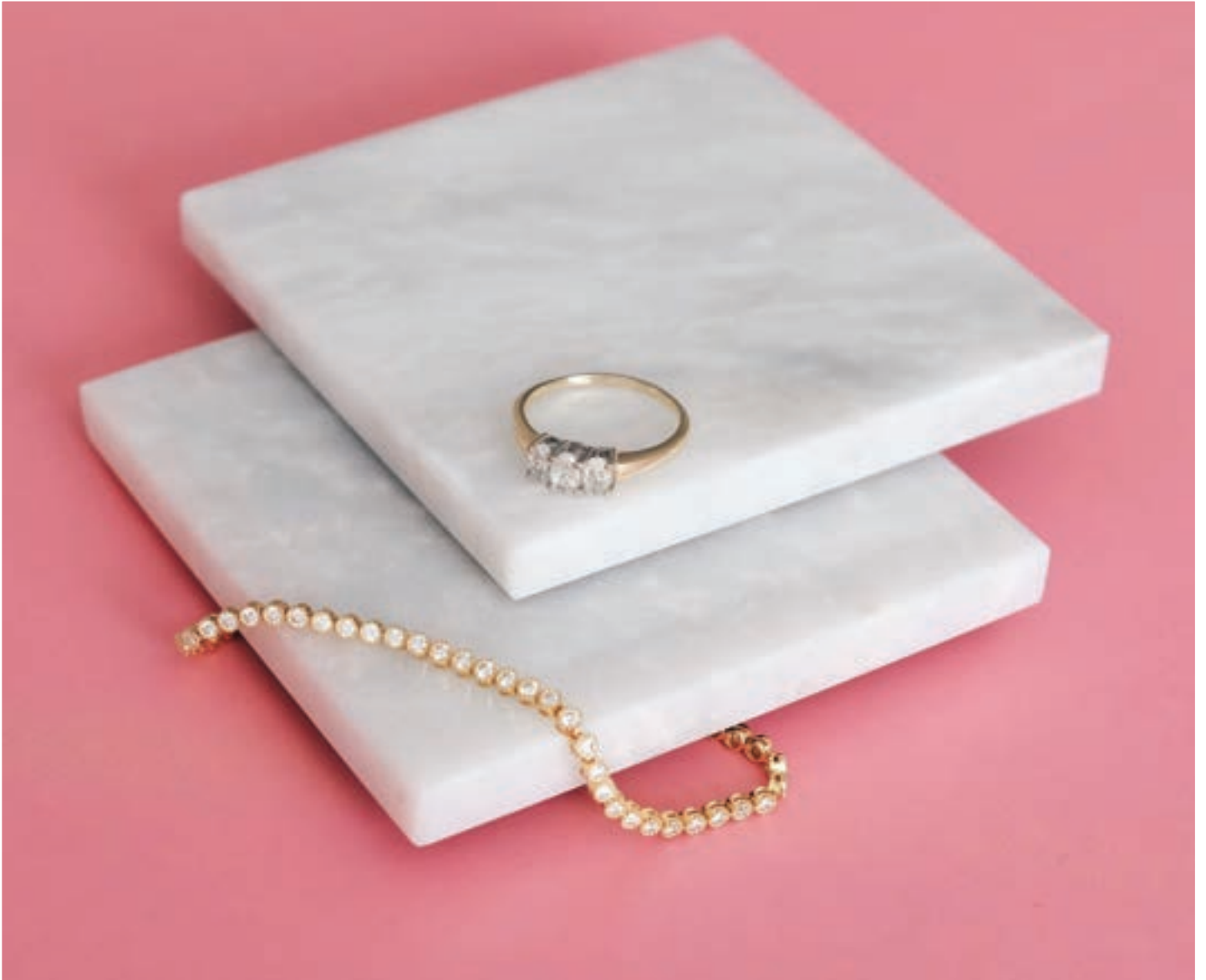
Ring & Bracelet: Stylist's Own