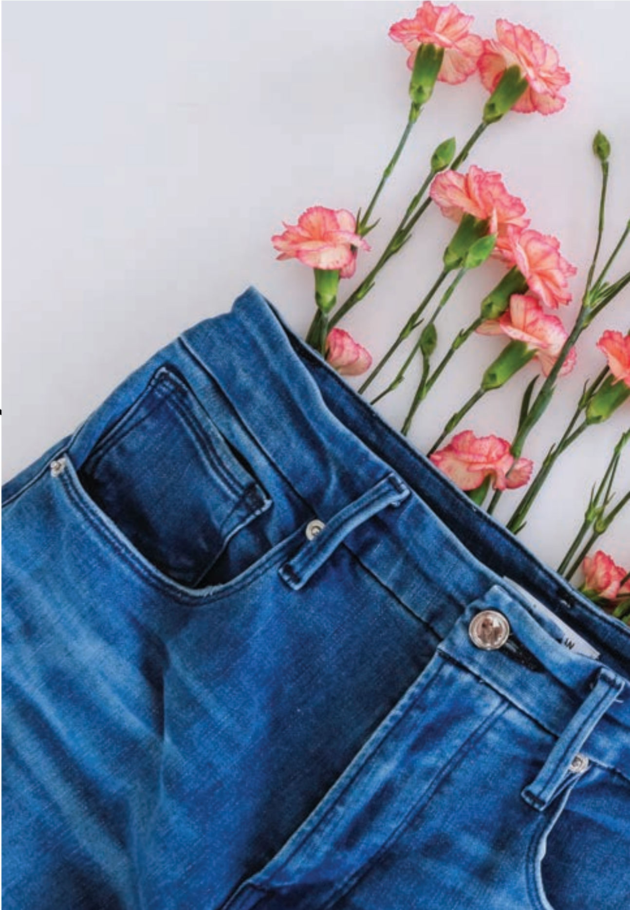
Jeans: Good American Good Waist