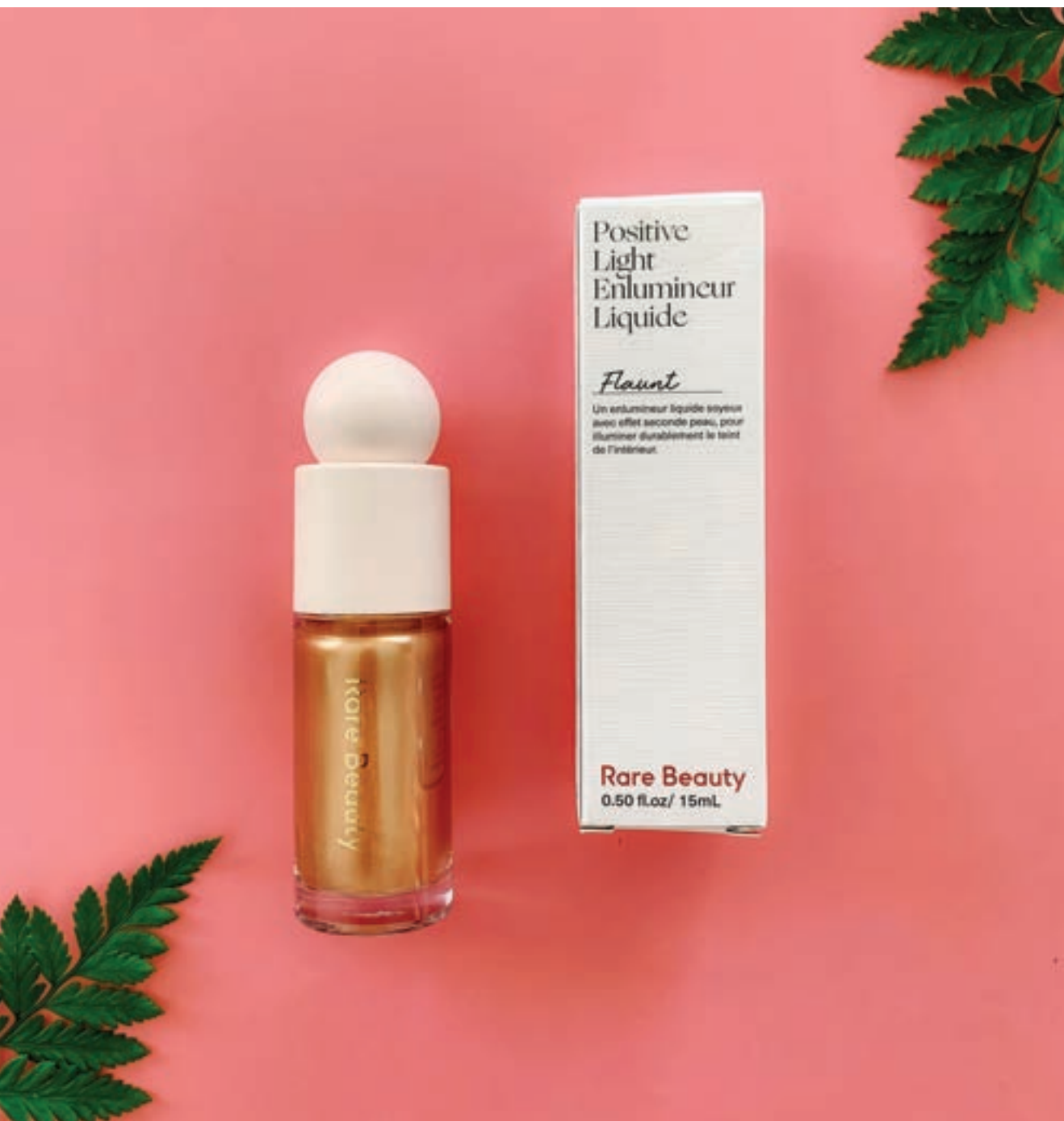
Highlighter: Rare Beauty