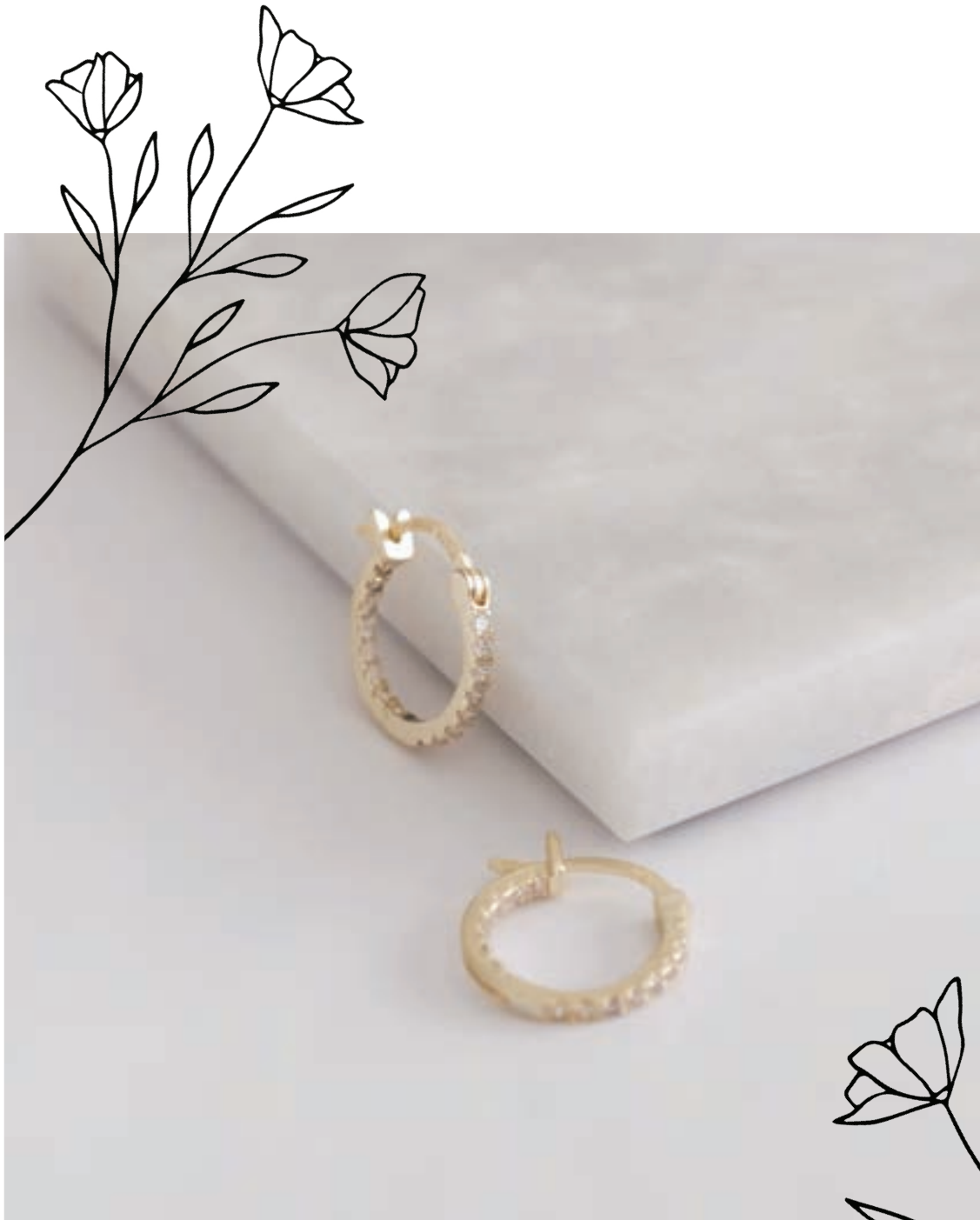
Earrings & Ring: Stylist's Own