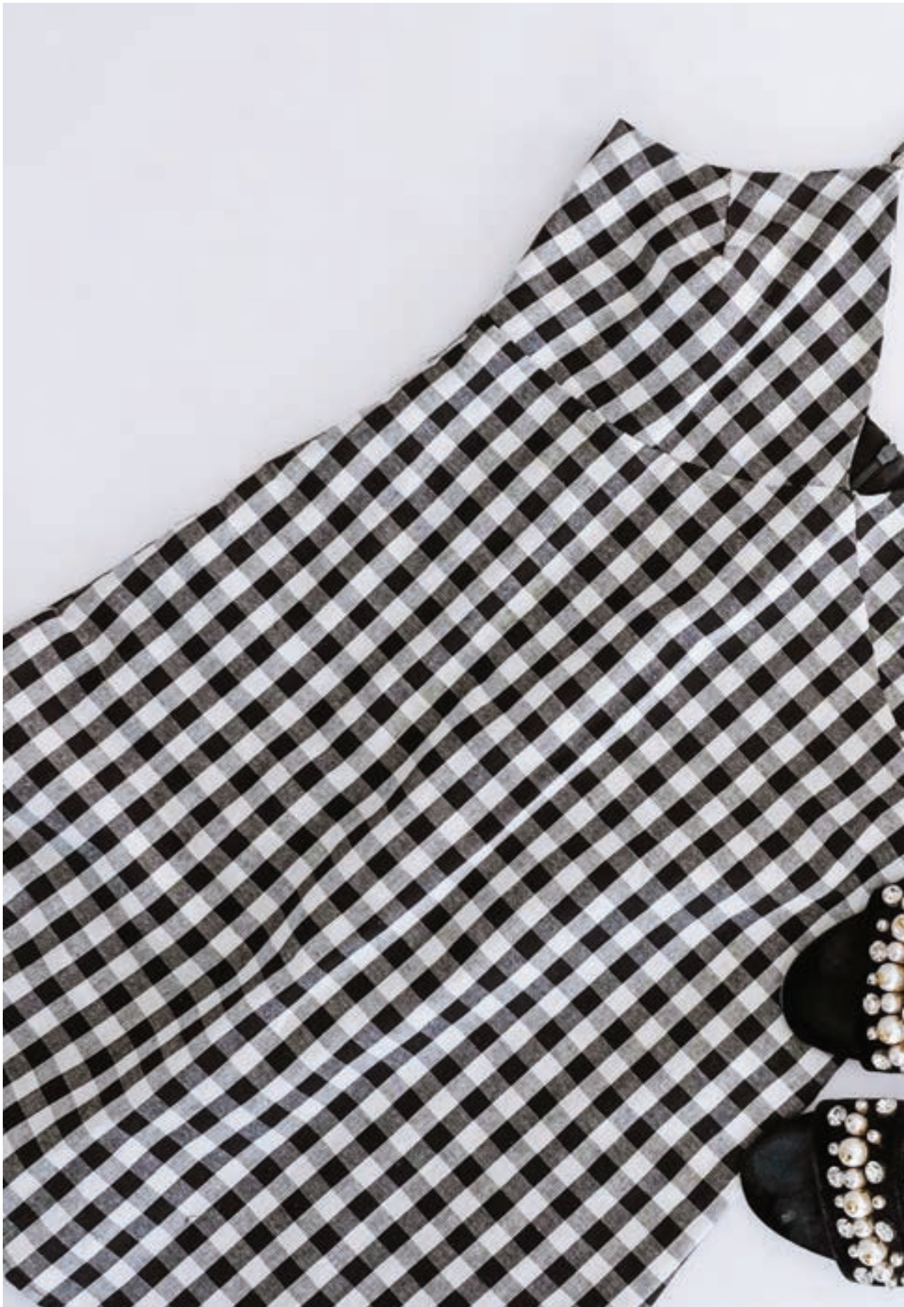
Dress & Shoes: Stylist's Own