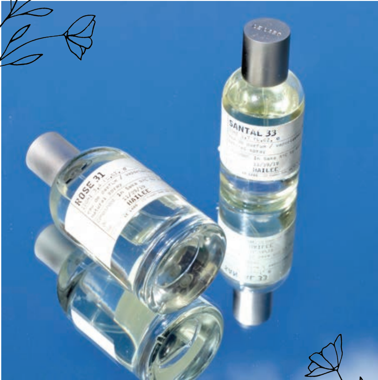
Perfume: Le Labo Rose 31 & Le Labo Santal 33