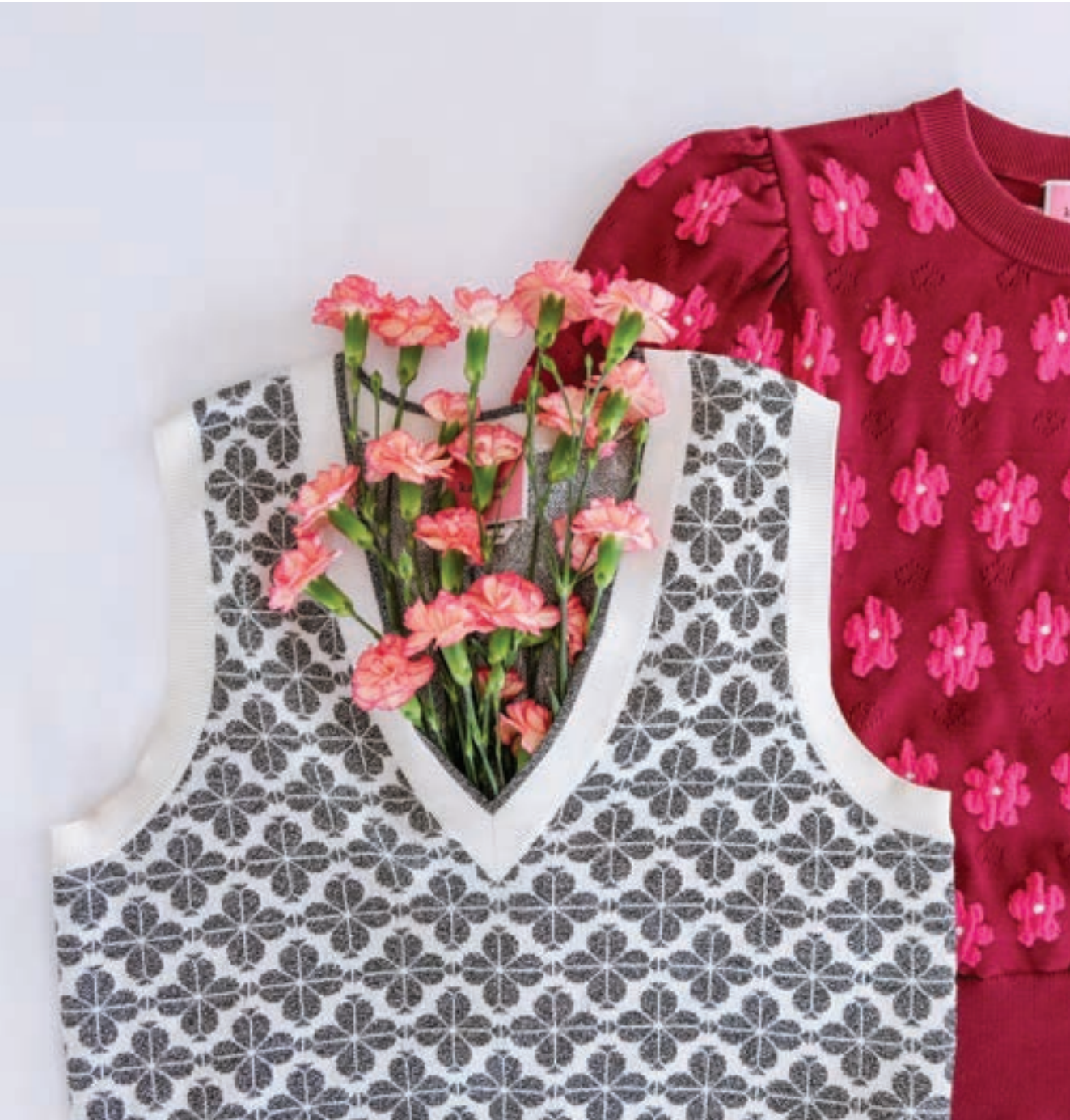
Sweaters: Kate Spade