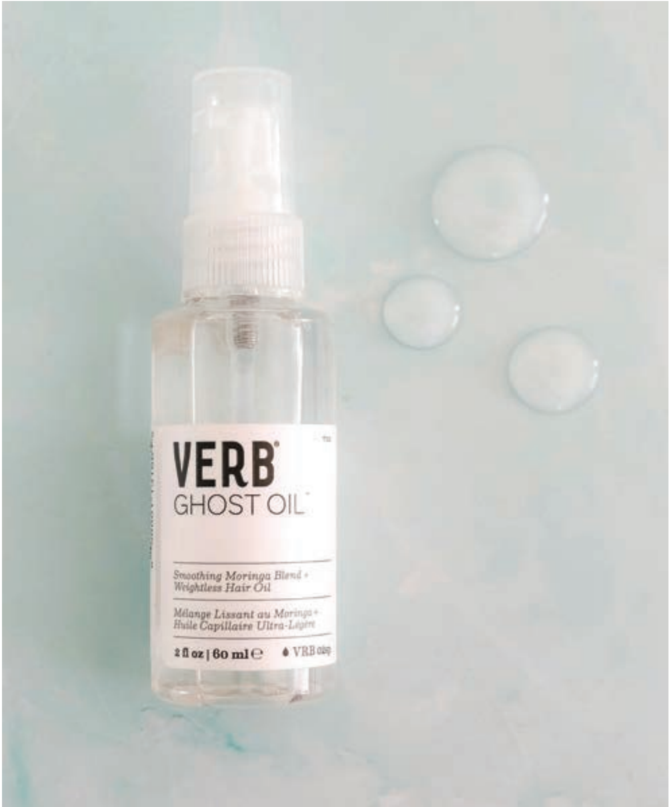
Hair Oil: Verb