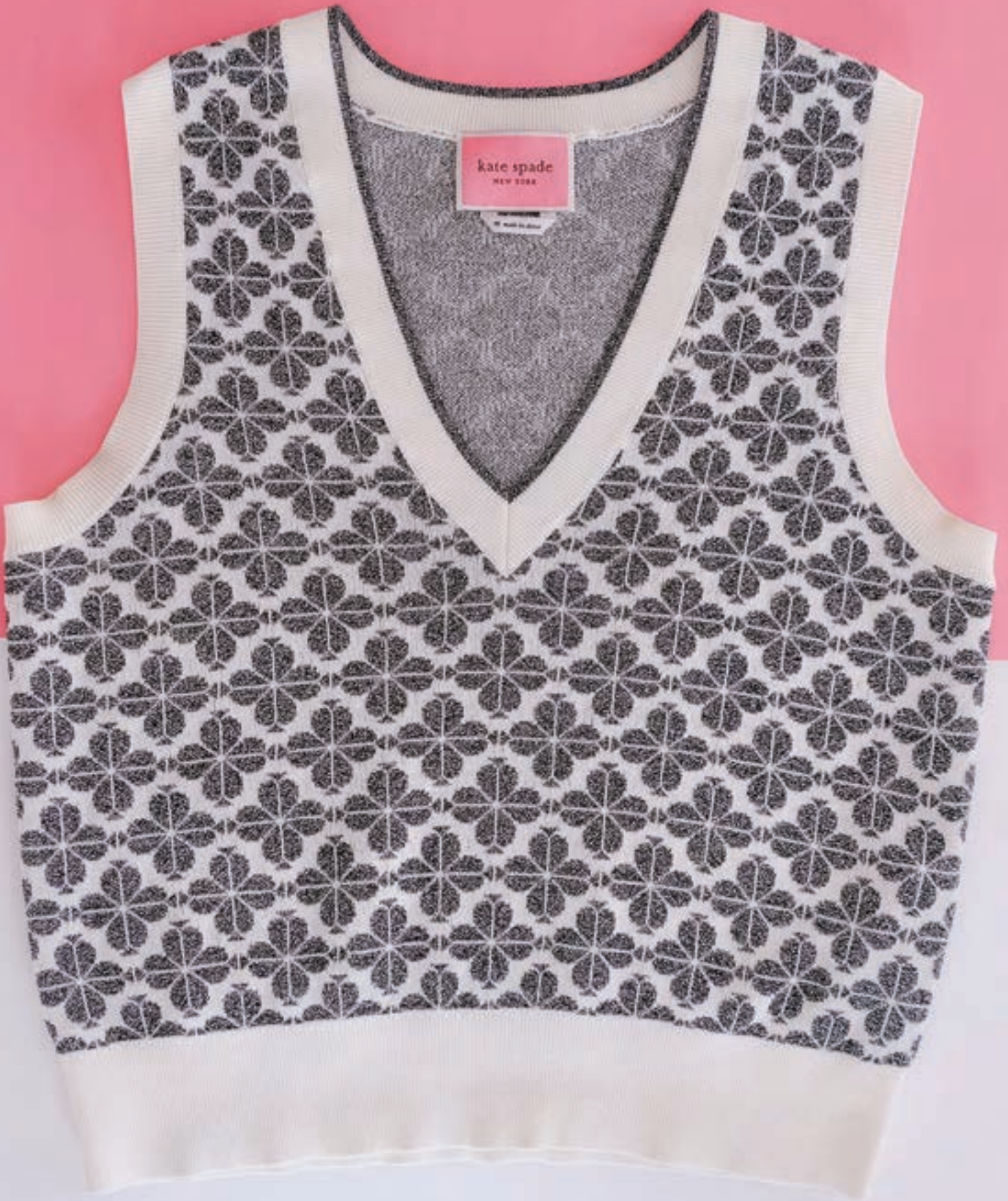
Cover Sweaters: Kate Spade