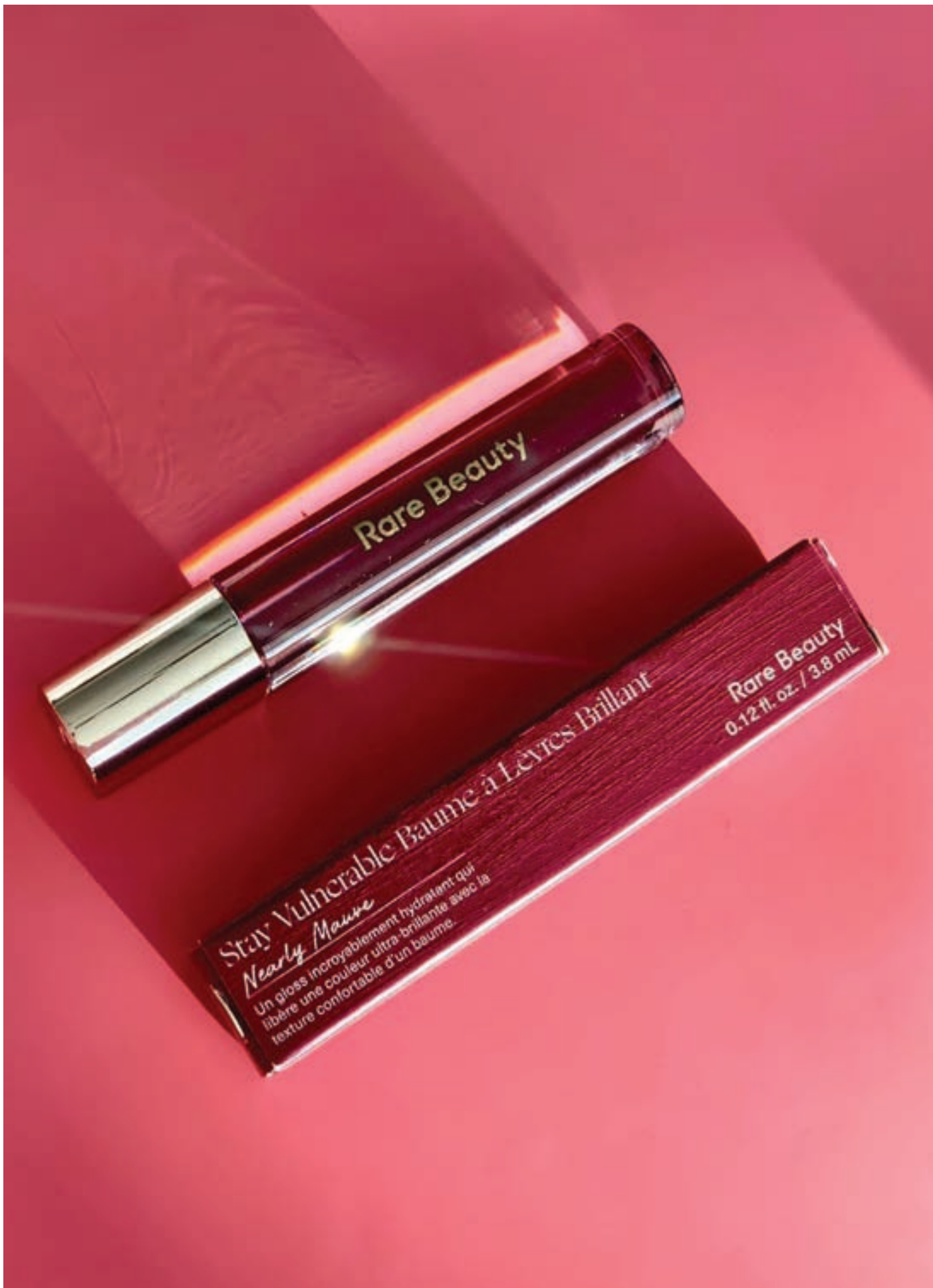
Lipgloss: Rare Beauty