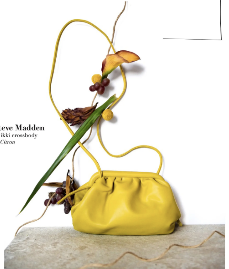
Steve Madden Bnikki crossbody in Citron