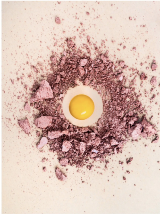
Milani baked blush in Berry Amore